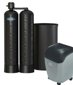
POE & POU Water Softeners

KineticoPRO offers a complete range of commercial water treatment solutions. Based on a per-location water analysis, we will work with you to prescribe the ideal water filtration, softening, and reverse osmosis solutions to optimize your water quality and protect your equipment.