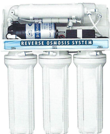
Booster Pump Model: RO75BP